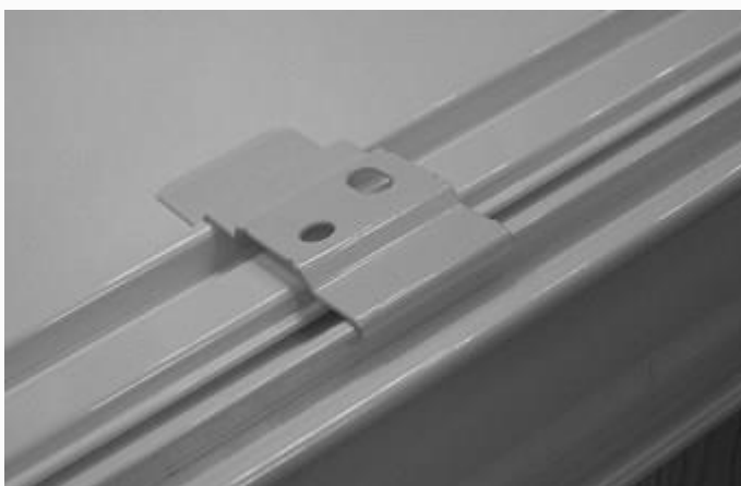
Headrail cassette fitted into bracket